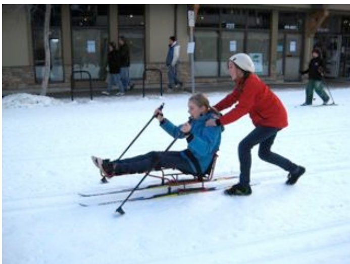
The skis we are having built, assuming we get approved for funding, will look similar to this model